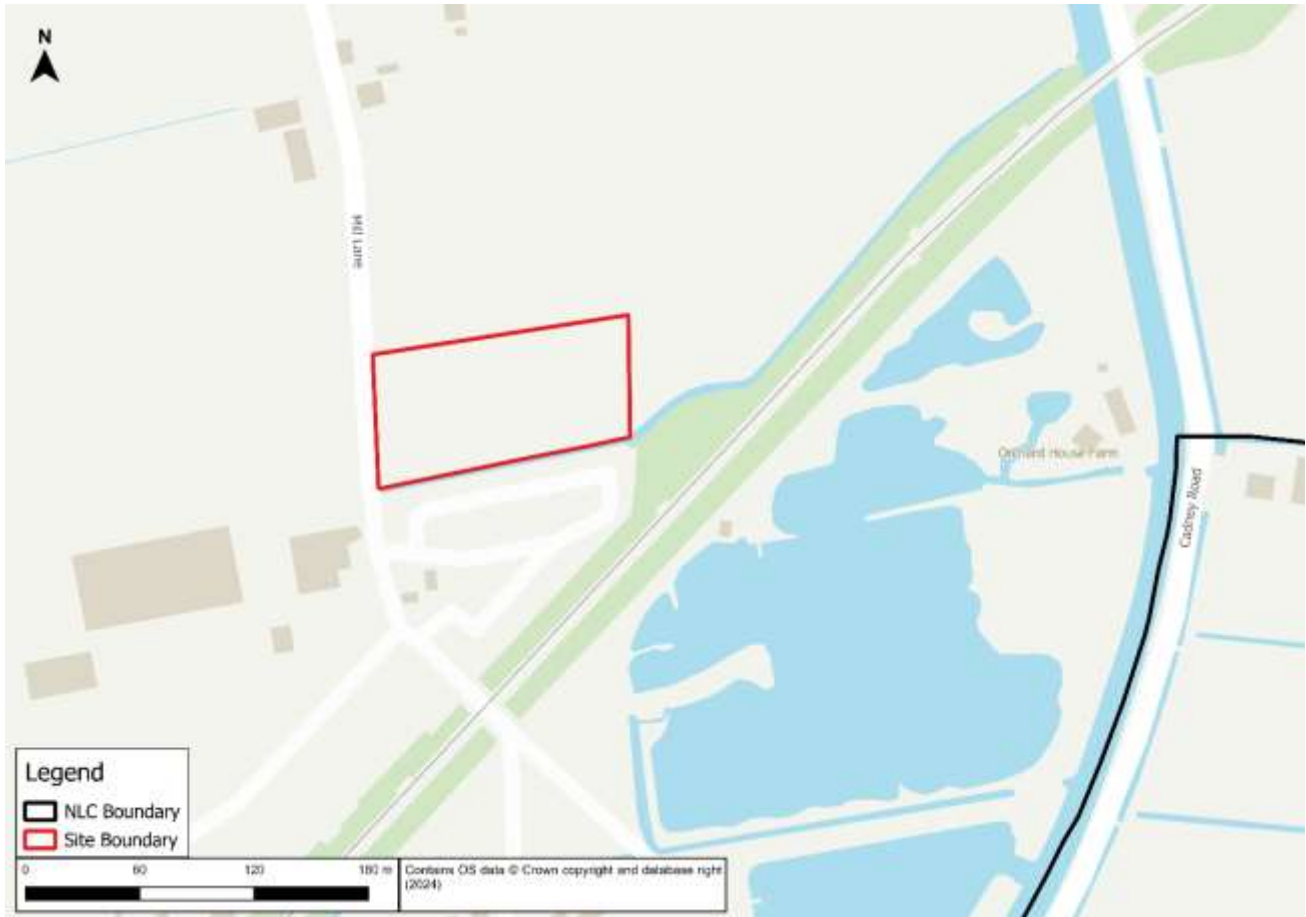
Figure 1-1: Site Location

Development of Policy H6-1 is to be brought forward by the developer. The delivery of the site is expected in the first ten years of the plan period.